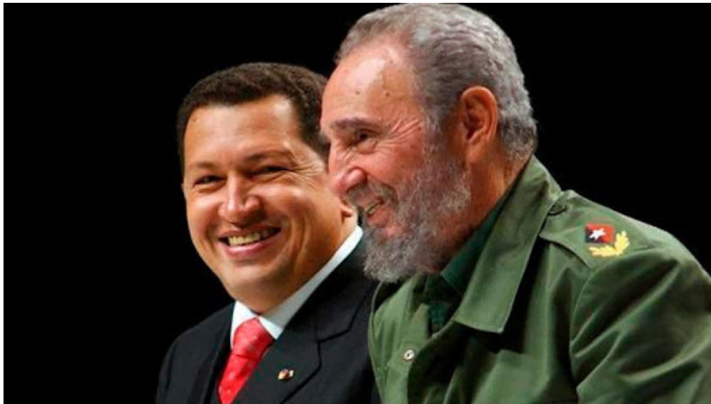
Hugo Chavez and Fidel Castro, the legendary commanders of Venezuela and Cuba.

Havana, October 31 (RHC)--The president of the Republic of Cuba, Miguel Díaz-Canel, assured that 20 years after the establishment of the Comprehensive Cooperation Agreement between Cuba and Venezuela, "what it has given us is teaching and learning for collaboration among peoples.