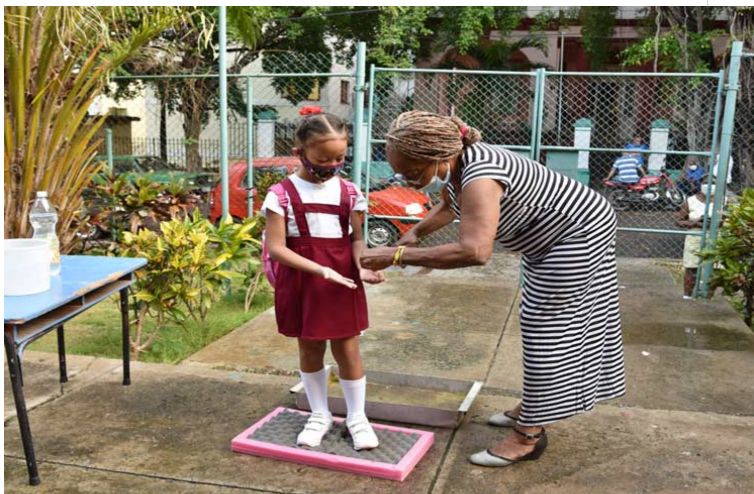
Special hygienic measures at school entrance.

Havana, November 2 (RHC)— Cuba's capital resumes Monday the 2019-2020 school year to end the academic cycle interrupted in March due to the Covid-19 pandemic. Some of the other provinces are beginning the new school year.