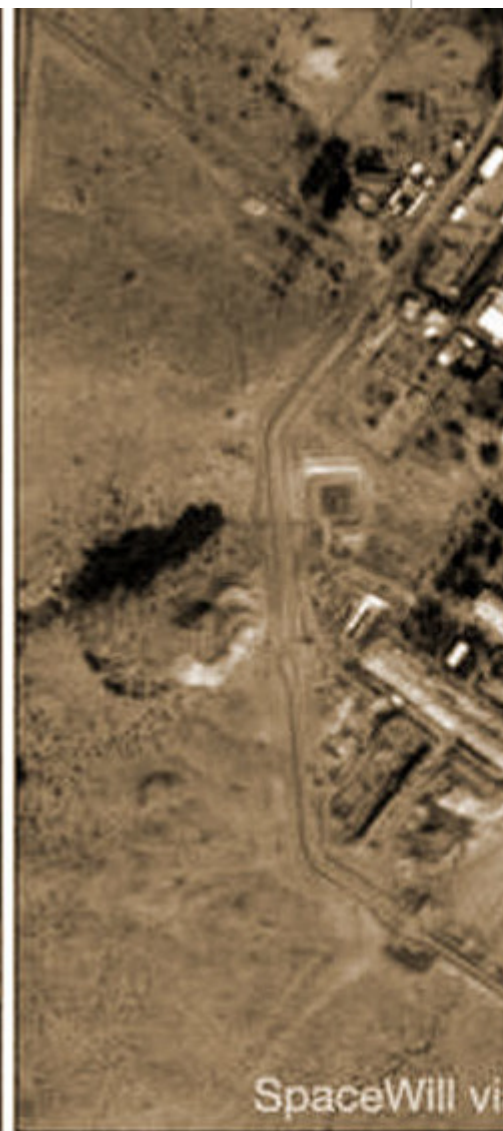
Satellite images reveal Israel quietly expanding secretive Dimona nuclear site