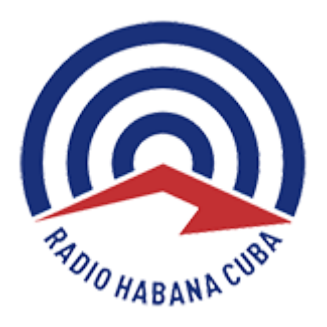
Radio Habana Cuba

https://www.radiohc.cu/en/noticias/internacionales/252637-paho-says-covid-surge-in-americas-could-beeven-larger-than-in-2020