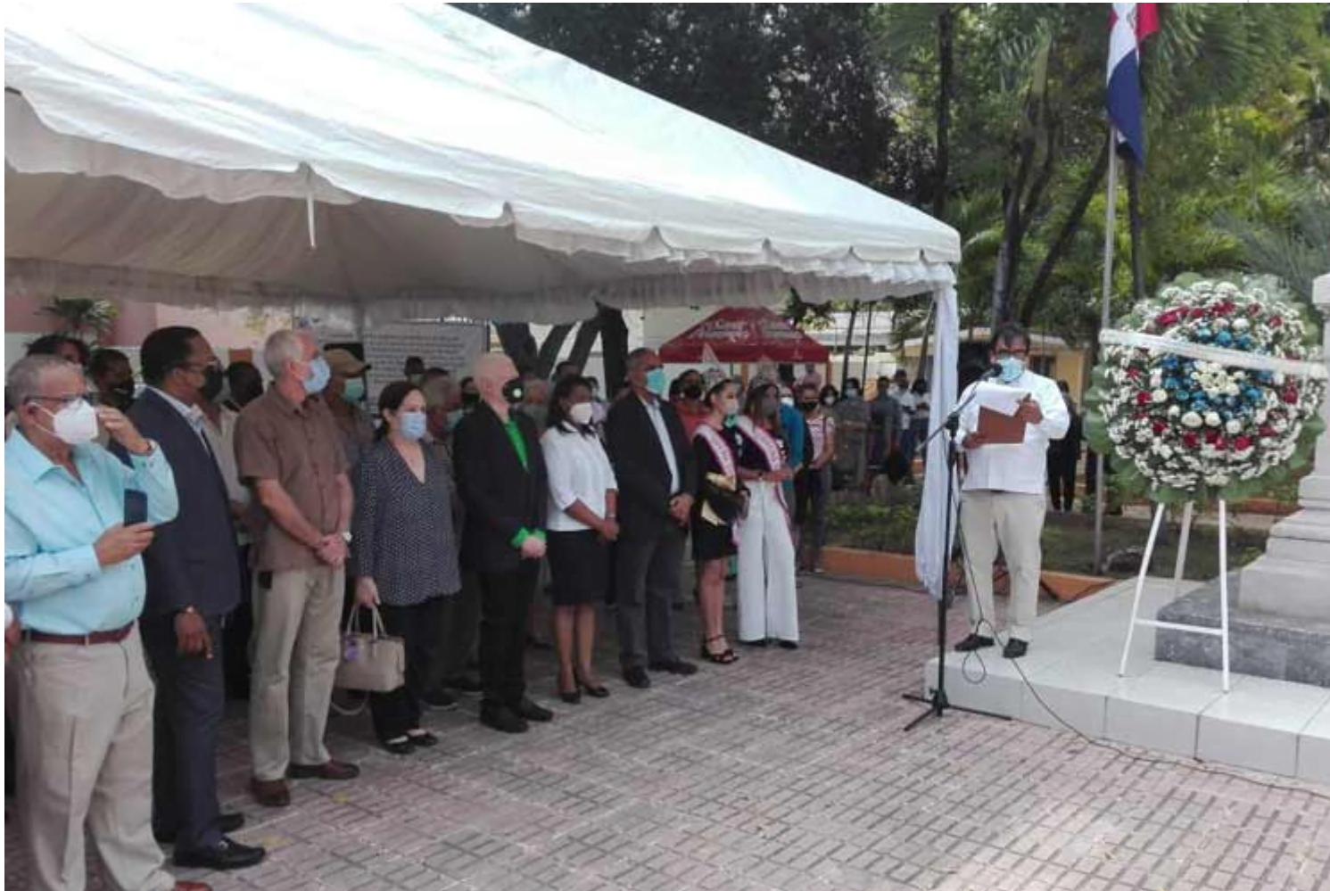
The ceremony took place in the Máximo Gómez Park in Bani, the hometown of the Dominica-Cuban patriot.

Santo Domingo, April 12 (RHC) --Cubans and Dominicans commemorate on Sunday in the locality of Bani, the 126th anniversary of the landing of José Martí and Máximo Gómez in Playitas, Cuba, to rejoin the independence struggle that began on February 24, 1895.