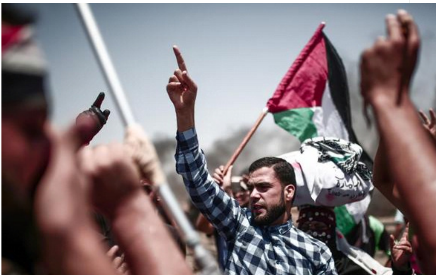
Thousands of Palestinians took to the streets in the Gaza Strip after the Friday prayers in solidarity with Jerusalem al-Quds

Gaza City, May 1 (RHC)-- Thousands of Palestinians took to the streets in the Gaza Strip after the Friday prayers in solidarity with Jerusalem al-Quds and its people. The Hamas movement organized the mass rally.