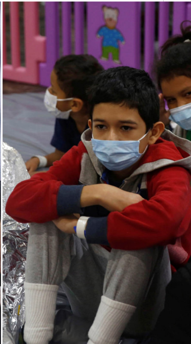
Texas Governor Greg Abbott to shut down shelters for migrant children