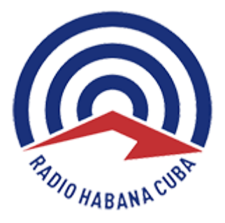
Radio Habana Cuba

\frac{https://www.radiohc.cu/en/noticias/internacionales/269539-air-pollution-from-coal-fired-power-plants-kills-thousands-in-european-union}{thousands-in-european-union}