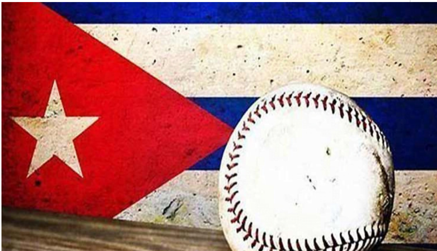
Baseball receives Cuban Cultural Heritage status

Matanzas, October 19 (RHC/PL)-- Baseball receives the status of Cultural Heritage of Cuba at the Palmar de Junco Stadium in Matanzas on Tuesday, in a ceremony that will be loaded with symbolism, patriotism and art.