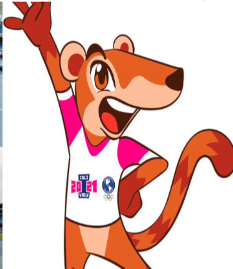
Pana, the mascot of Cali-Valle 2021

Bogota, November 10 (PL)-- Colombia continues the preparations for the I Pan American Junior Games Cali-Valle 2021 whose mascot or character will be Pana, the symbol of friendship.