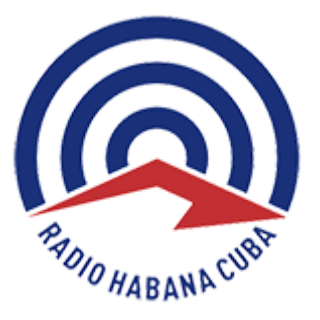
Radio Habana Cuba

https://www.radiohc.cu/en/especiales/comentarios/277286-two-pandemics