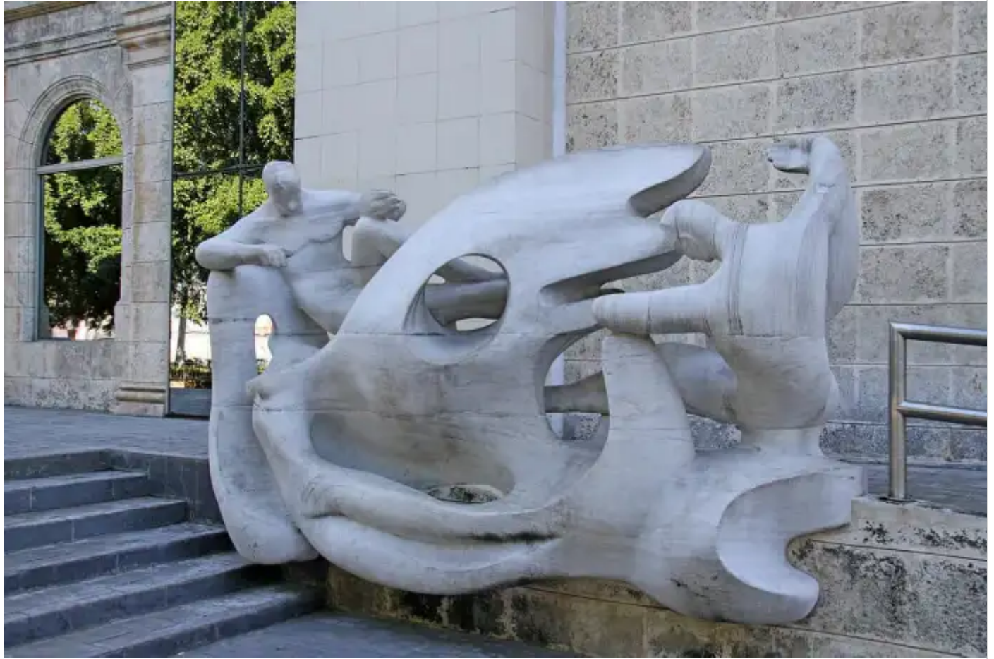
Shape, Space and Light