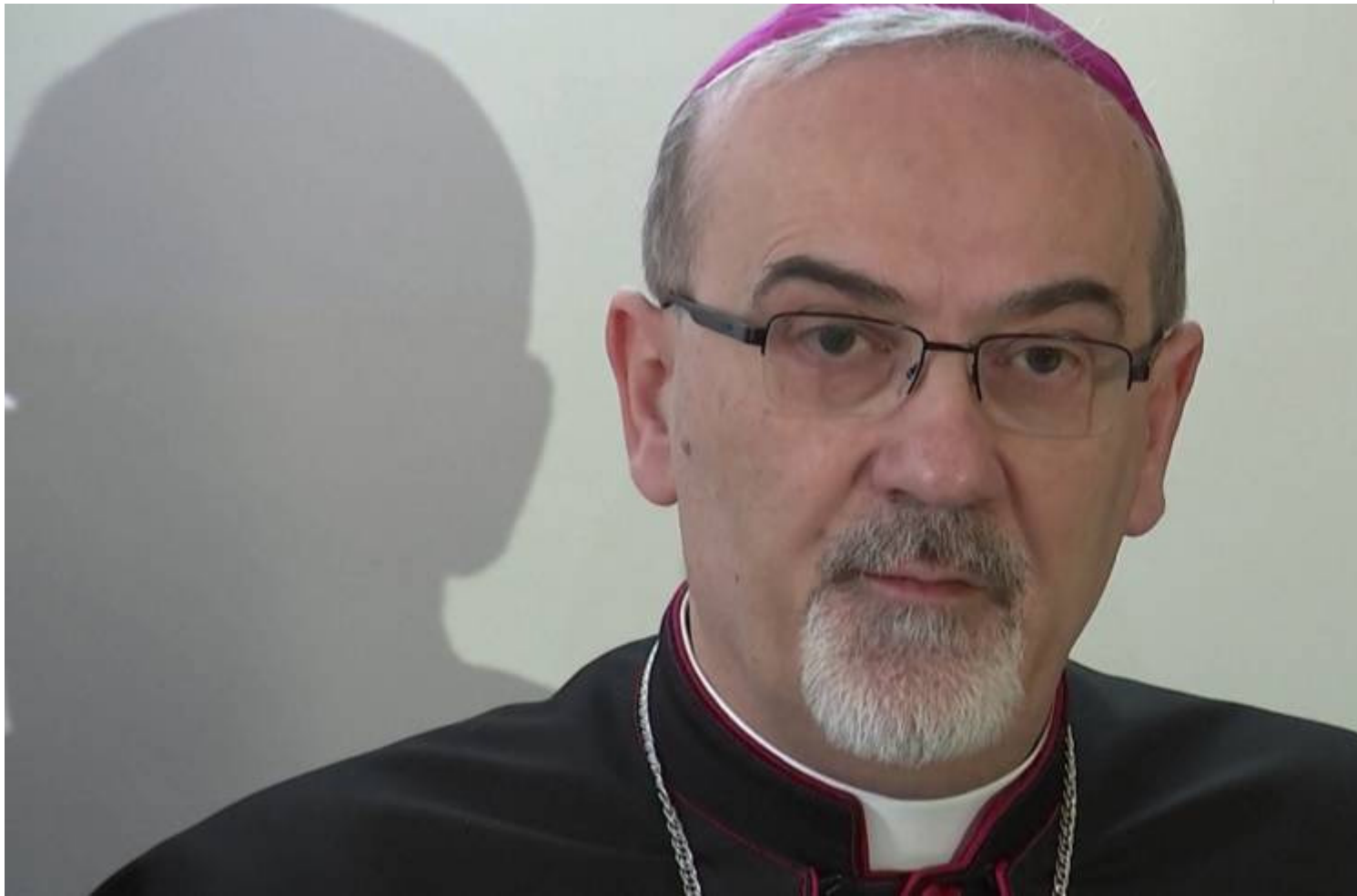
Catholic Archbishop in Jerusalem condemns Israeli violence at funeral of Shireen Abu Akleh

Archbishop Pierbattista Pizzaballa: "The police stormed into a Christian health institute, disrespecting the church, disrespecting the health institute, disrespecting the memory of the deceased and forcing the pallbearers almost to drop the coffin. Israel's police invasion and disproportionate use of force, attacking mourners, striking them with batons, using smoke grenades, shooting rubber bullets, frightening the hospital patients, is a severe violation of international norms and regulations."