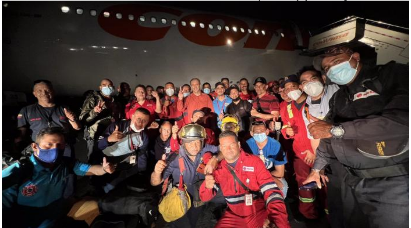
It carried 35 Petroleos de Venezuela (PDVESA) specialists and approximately 20 tons of consumables (foam) and chemical powders to control the blaze.

A Conviasa aircraft from Venezuela arrived a few hours later with solidarity aid to help quell the large-scale fire.