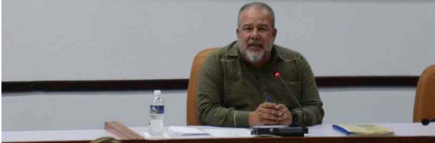
Cuban Prime Minister participates in annual assessment of the Ministry of Finance and Prices

Havana, April 4 (RHC)-- Cuban Prime Minister Manuel Marrero Cruz participated today in Havana in the annual assessment of the Ministry of Finance and Prices (MFP).