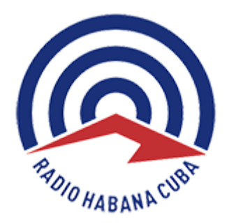
Radio Habana Cuba

https://www.radiohc.cu/en/noticias/internacionales/331752-venezuela-increases-oil-production-despite-ussanctions