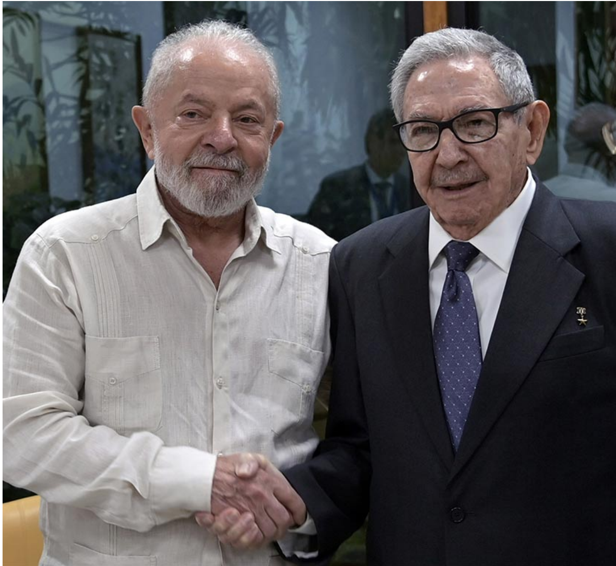
Raul Castro gave a warm welcome to the President of Brazil, Luiz Inacio Lula da Silva

In dialogue with Lula, Raul Castro reiterated his country's willingness to promote political, economic, commercial and cooperation ties in areas of mutual interest, in keeping with the historic ties of friendship between the two nations.