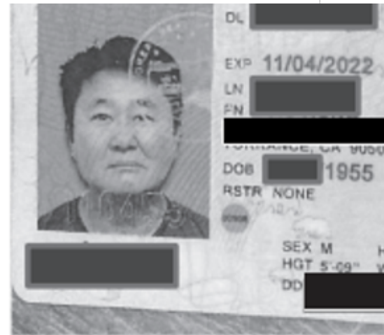
Figure 7: L.H.K. driver license