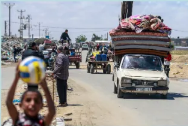
Displaced Palestinians who left with their belongings from Rafah following an evacuation order by the Israeli army, arrived in Khan Younis on May 6, 2024