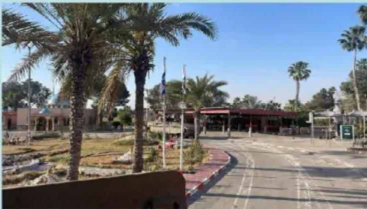
Rafah border crossing with Egypt after Israeli forces took control of the Palestinian side of the of the frontier on May 7, 2024

Israeli tanks have taken over the Rafah border crossing, Gaza's aid lifeline, after advancing during the night as their warplanes pounded residential buildings, killing at least 12 people.