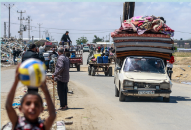
Displaced Palestinians who left with their belongings from Rafah following an evacuation order by the Israeli army, arrived in Khan Younis on May 6, 2024