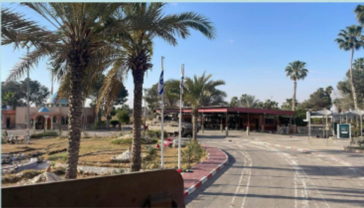
The Rafah border crossing with Egypt after Israeli forces took control of the Palestinian side of the of the frontier on May 7, 2024

Israeli tanks have taken over the Rafah border crossing, Gaza's aid lifeline. The only crossing with Egypt is both an entry point for humanitarian workers entering Gaza and a crucial exit for critically sick and injured people seeking treatment abroad.