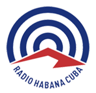
Radio Habana Cuba

https://www.radiohc.cu/en/noticias/internacionales/359315-at-least-10-israeli-troopers-killed-in-gaza-in-resistance-fighters-attacks