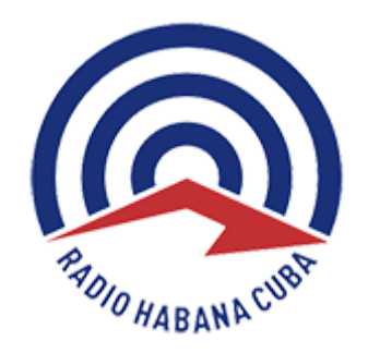
Radio Habana Cuba

https://www.radiohc.cu/en/noticias/internacionales/360446-thousands-of-israeli-settlers-seek-shelter-ashezbollah-fires-missile-barrage