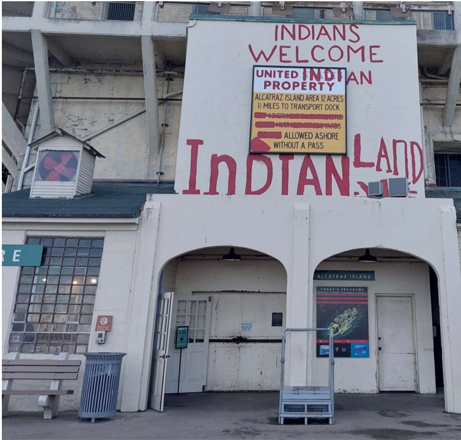
The Barracks on Alcatraz Island greets you with a welcome that has remained since the occupation in 1969.

Let's reject all settlers myths this Thanksgiving and honor Indigenous resistance.