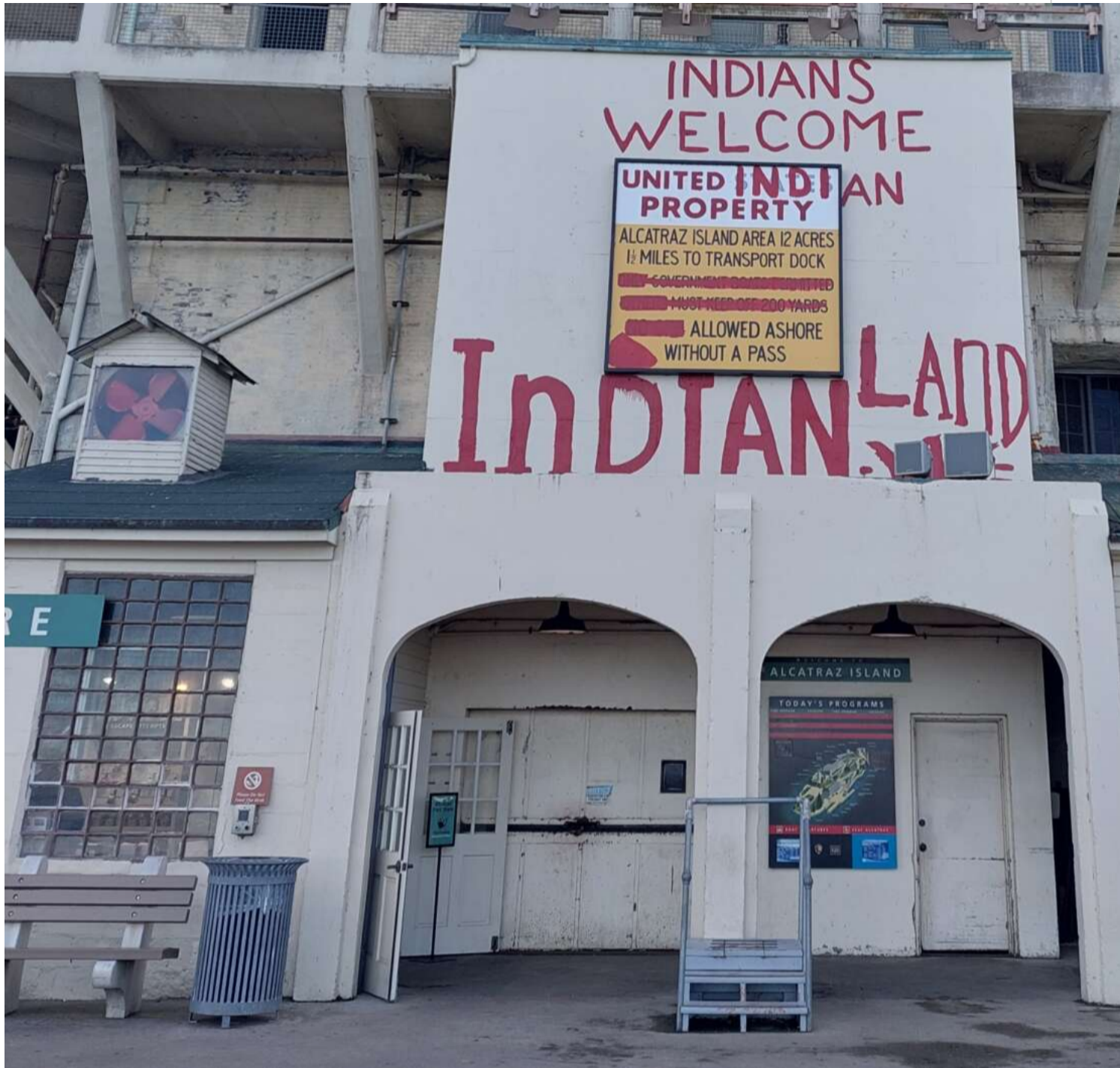
The Barracks on Alcatraz Island greets you with a welcome that has remained since the occupation in 1969.

Let's reject all settlers myths this Thanksgiving and honor Indigenous resistance.