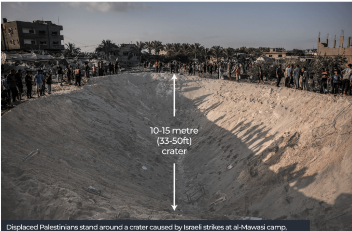
Displaced Palestinians stand around a crater caused by Israeli strikes at al-Mawasi camp, Khan Younis, southern Gaza, on September 10, 2024