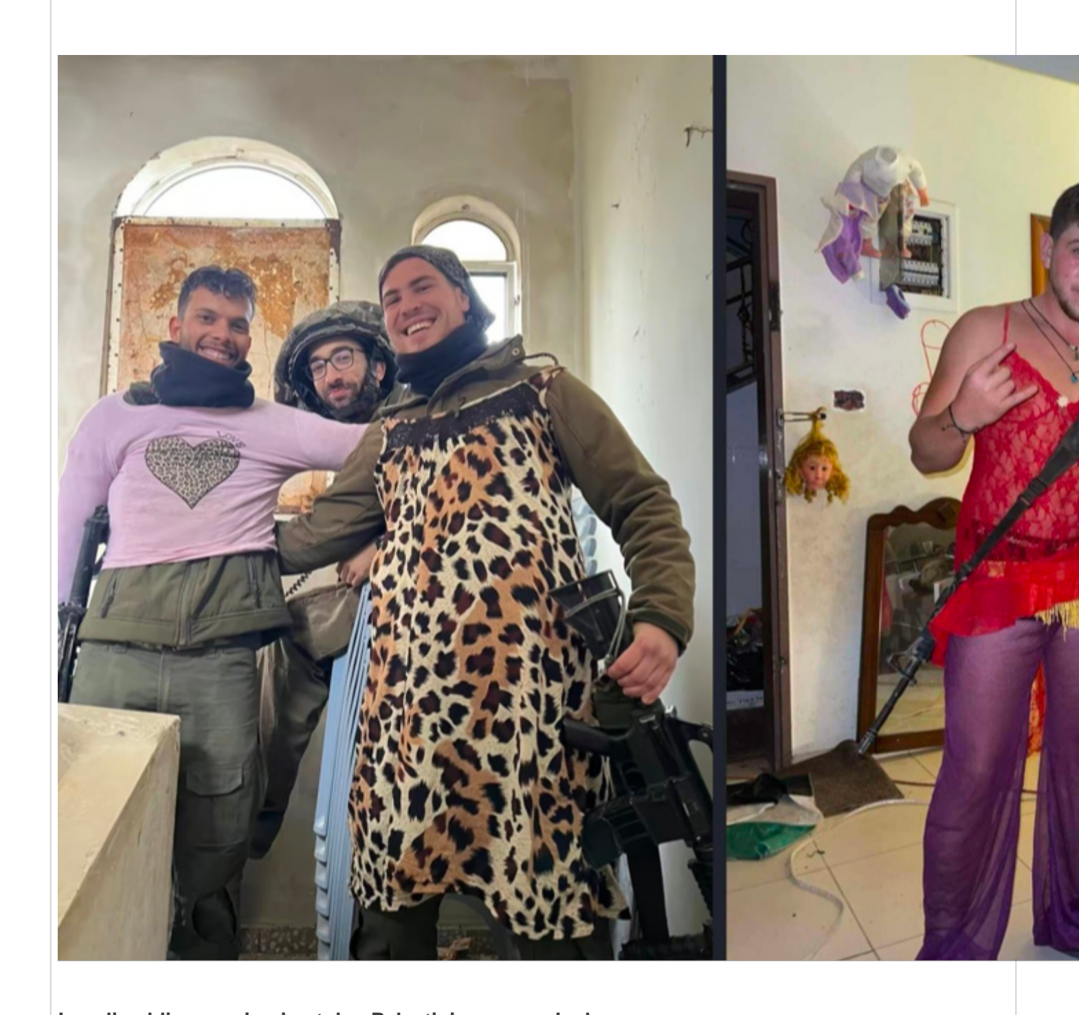
Israeli soldiers posing in stolen Palestinian women's dresses

That same month, deeply disturbing footage surfaced showing Israeli soldiers inside a Palestinian child's bedroom, filming a doll and a stuffed toy dangling from a ceiling fan, turning a child's innocent playthings into a twisted display of terror.