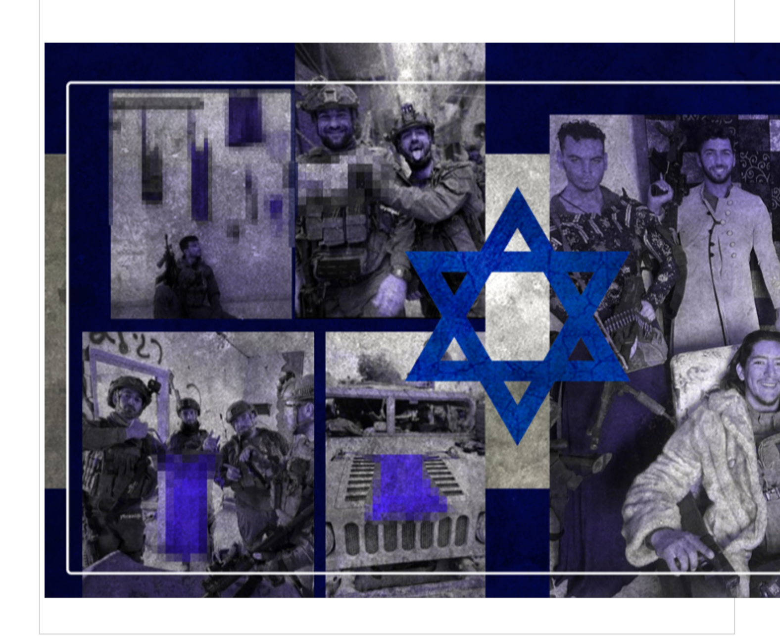
By Ivan Kesic / PRESS TV