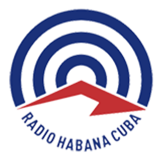
Radio Habana Cuba

https://www.radiohc.cu/index.php/en/noticias/cultura/290293-silvio-rodriguez-concert-to-close-clacsomeeting