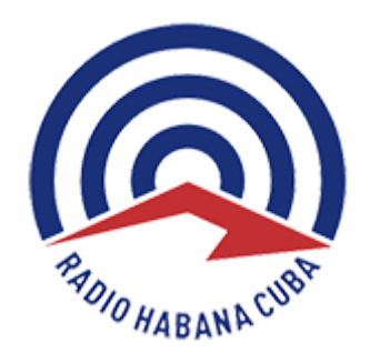
Radio Habana Cuba

https://www.radiohc.cu/index.php/en/noticias/internacionales/347541-gazas-nasser-hospital-completely-outof-service-as-israeli-attacks-mount